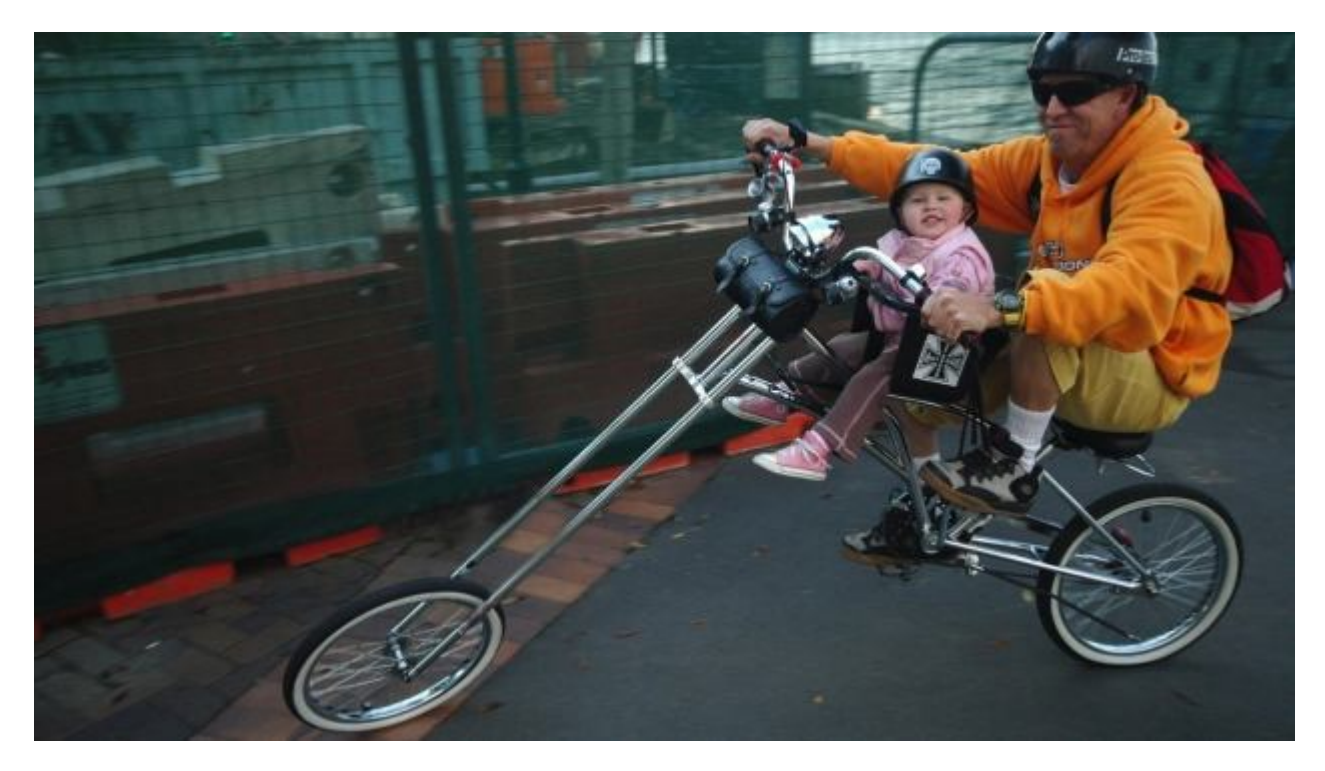
Cycling is something the whole family can do together

Moreover, your riding habit could be sowing the seeds for the next Bradley Wiggins. Studies have found that, unsurprisingly, kids are influenced by their parents' exercise choices.