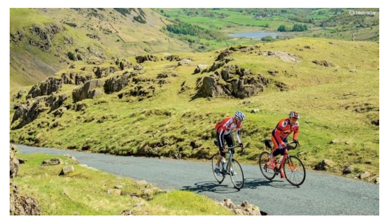
Riding regularly will help you burn off the fat

And as you get fitter, the benefits are more profound. One recent study showed that cyclists who incorporated fast intervals into their ride burned three-and-a-half times more body fat than those who cycled constantly but at a slower pace.